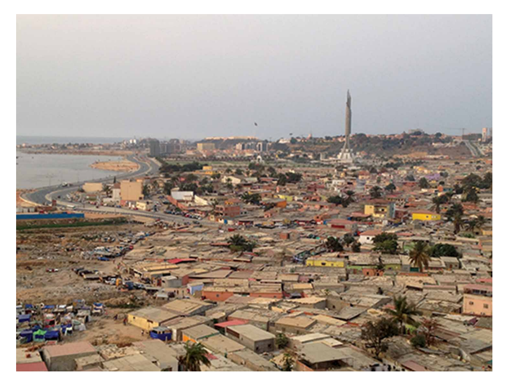
Figure 1. Stereotypical view of the unplanned city Source: Author, Luanda, September 2013.

Figure 1 shows the stereotypical view of Luanda: self-built houses anarchically flocked together in an impenetrable urban fabric. At first sight, one would qualify this view as a musseque . But this picture, taken less than a kilometre from the historical centre of the city, actually depicts neighbourhoods that were originally built by Portuguese families following municipal regulations, though they were not part of the colonial master plan for the city. The large road that curves into the area today is the first stage of a massive renovation project meant to transform the residential area into a brand new administrative and political centre. This urbanisation process reminds us that the distinction between centre and periphery is a social construct that is constantly re-defined as located places are given new meanings within the ever-growing urban fabric. What was first built as an extension of the centre during colonial times then turned into a musseque during the civil war but the area is now given a new value and the popular neighbourhoods are destined for demolition.