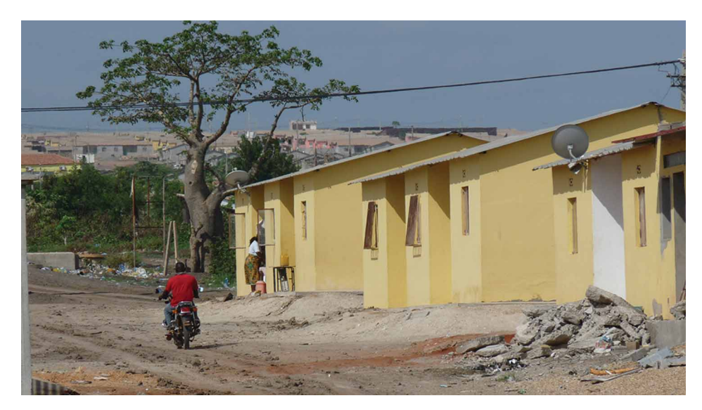
Figure 3. Outcast? A view of sector 9, Panguila

cation. In 2003, the only road that linked Panguila to the city had not been maintained since the beginning of the civil war in 1975. It took at least two hours to reach the historic core of the city. Psychologically, the distance was even bigger, as for many people leaving the urbanised area of the capital was still seen as a risky adventure into war-ridden provincial territories. In every aspect, the new settlement appeared as a remote rural area, a negation of urbanity. The imbondeiro (baobab tree in the background) and the motoqueiro (motorbike taxi, by opposition to the minibuses taxi that deserve the city) that appear on Figure 3 are symbolical markers of this rurality.