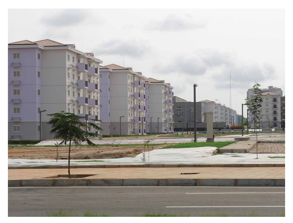
Figure 4. A view of Kilamba City before its opening to public purchase

The idea of 'affordable housing' rests on a rent-to-buy scheme that breaks away from local practices where mortgages don't exist and where even rental arrangements rely on six to 12 months upfront payments, in cash and in US dollars. However, with monthly rents initially starting around US$600, a flat in Kilamba was largely overpriced for musseque residents. Moreover, access to the scheme was restricted to public officers backed by their employers, i.e. by the state itself, as no banking system was able to provide private mortgages. As a result, more than a year after its inauguration, Kilamba remained virtually empty and the procedures to buy a flat were so unclear that international media started (see Figure 4) to denounce the edification of a 'ghost city' disconnected from local needs (Redvers 2012; BBC 2012; Le Figaro 2012).